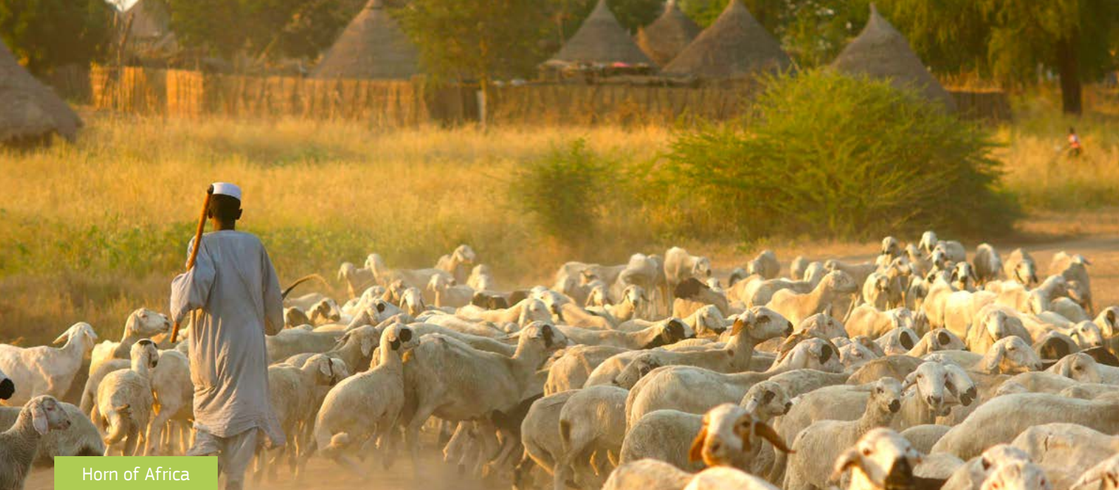
Horn of Africa