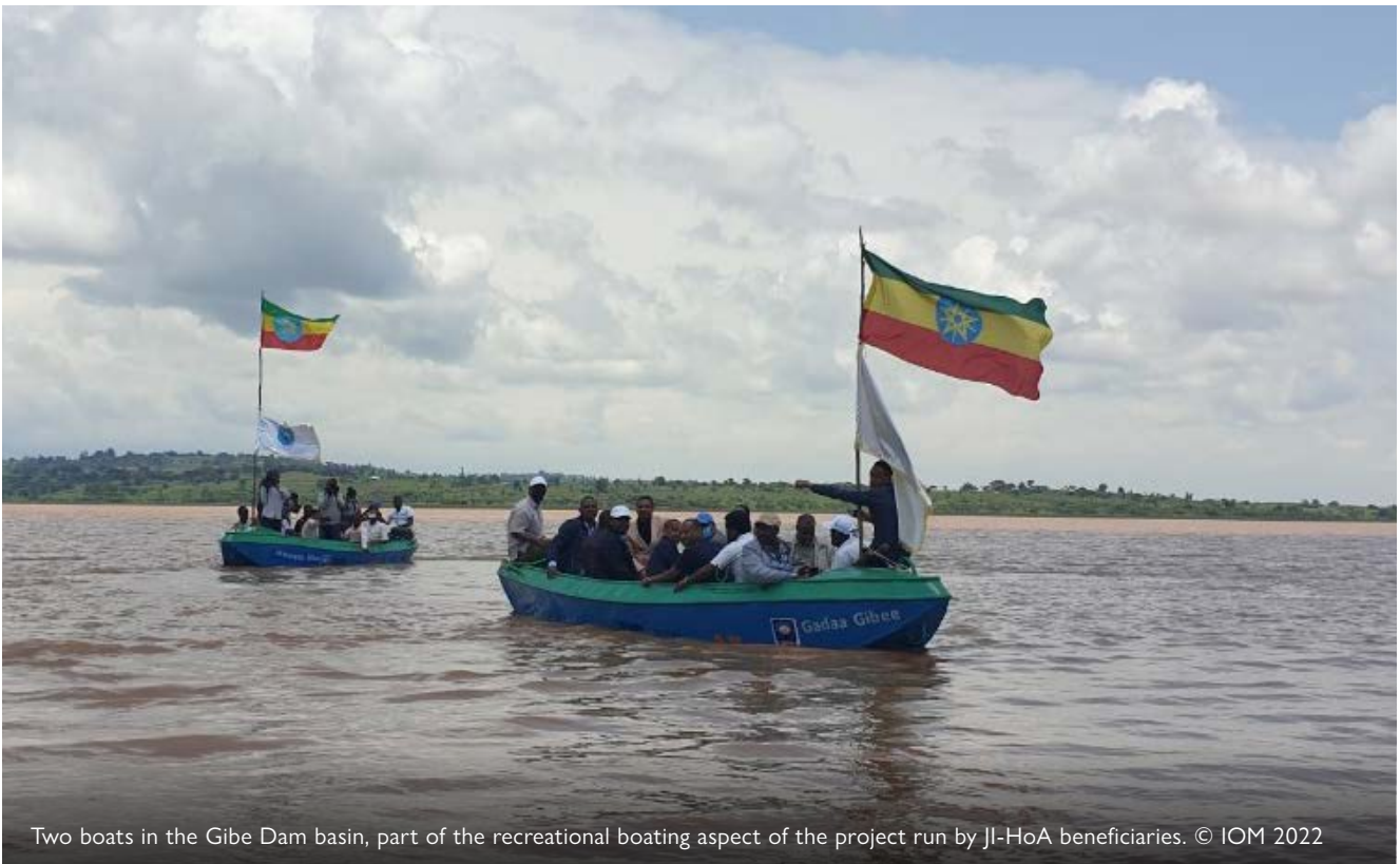
Two boats in the Gibe Dam basin, part of the recreational boating aspect of the project run by JI-HoA beneficiaries.

Additionally, it is not within the scope of the analysis to undertake an evaluation of the CBRPs that would provide detailed evidence of impact and outcomes based on a wide range of data sources, nor to address the whole range of the evaluation criteria of the Organisation of Economic Co-operation and Development / Development Assistance Committee.