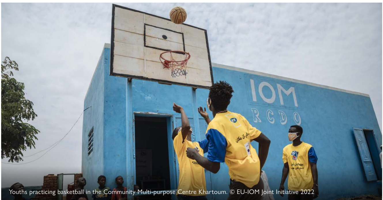
Youths practicing basketball in the Community Multi-purpose Centre Khartoum.

The set of documents available for CBRPs in the Sudan was relatively good compared to Ethiopia. The terms of reference, project agreement, progress reports and final reports were available for most of the CBRPs reviewed in the Sudan but at least one or more of these documents were missing in the majority of CBRPs reviewed in Ethiopia. However, in both countries, the inclusion of critical data, that is data gathered on outcome or impact-level change that are adequately monitored, recorded and reported, was limited for all projects. This meant that the research team was unable to provide a judgement for indicator data, and there were no baseline measures and data nor plans for when baselines would be conducted for all projects. Additionally, there was limited evidence of M&E data informing learning or adaptation taking place in the projects. While the country office noted that there are regular field visits and monitoring reports from implementing partners, the research team found limited evidence of this in the available documentation. However, the country office did share a PowerPoint presentation that highlights best practice from the CBRPs with the research teams, indicating there is learning generated at the country level.