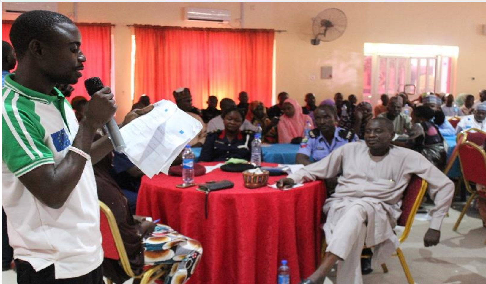
Youth presenting Community Safety Action Plans at state level during CSP workshop in Auno Community, Maiduguri LGA, Borno State.