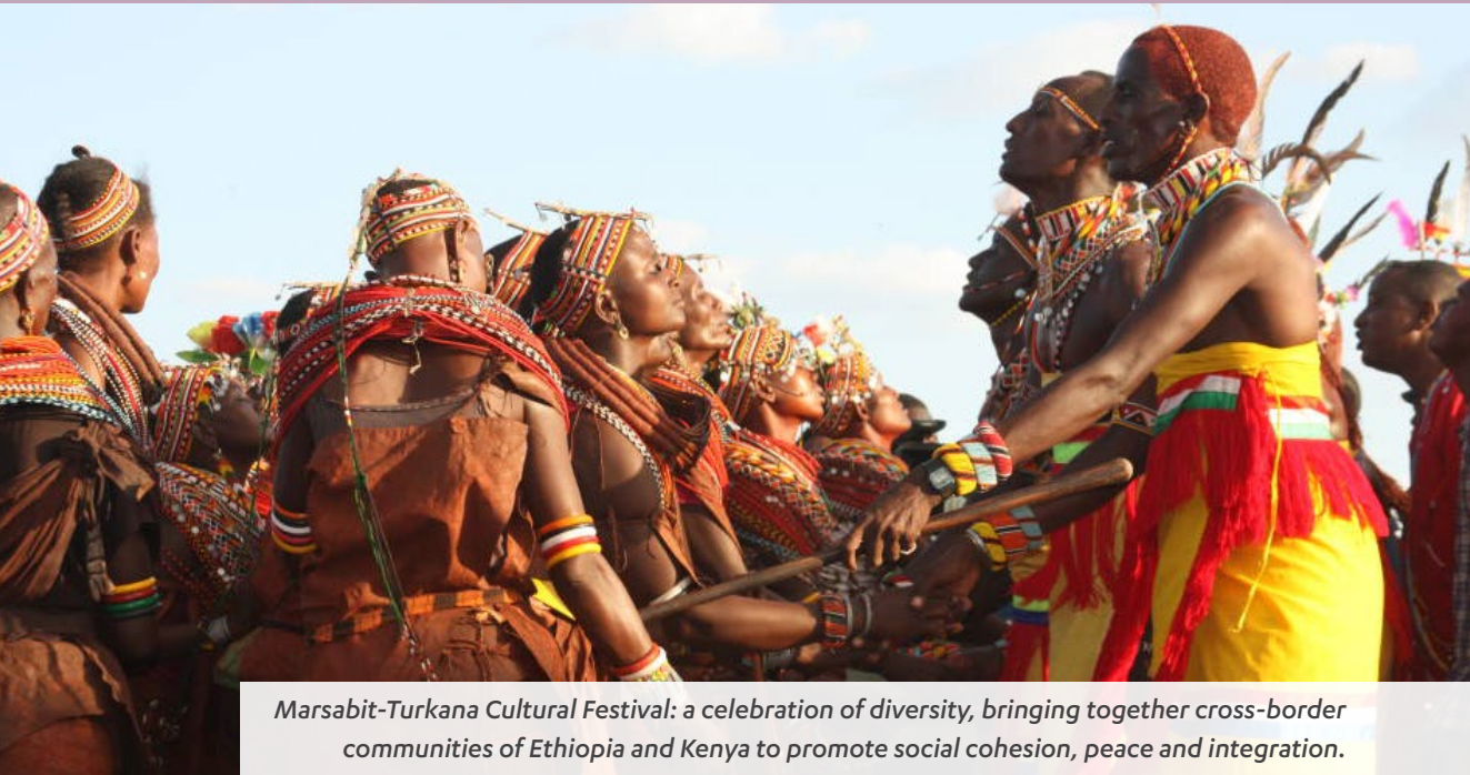
Marsabit-Turkana Cultural Festival: a celebration of diversity, bringing together cross-border communities of Ethiopia and Kenya to promote social cohesion, peace and integration.

While the economies of both Ethiopia and Kenya continue to grow, border areas in the northern Marsabit county of Kenya and the Borana and Dawa Zones of Ethiopia continue to be marred by violent conflicts and disputes over resources and ethnicity, environmental stress, poor infrastructure, high poverty levels and underinvestment. The EU-UN Cross-border cooperation between Ethiopia and Kenya for conflict prevention and peacebuilding aims at supporting the implementation of peacebuilding and conflict prevention initiatives to reduce vulnerability and increase resilience of communities affected by conflict. The project, which is being implemented by UNDP, will strengthen local peace architecture, establish conflict early warning systems and deliver tangible peace dividends to prevent resource-based conflict.