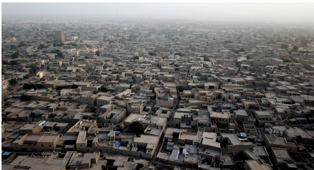
A view of Timbuktu, 16 January 2020.

Since 2018, the GI-TOC has undertaken monthly monitoring of human smuggling and trafficking in North Africa and the Sahel. The first report of the project, 'The human conveyor belt broken', published in early 2019, described the fall of the protection racket by Libyan militias that underpinned the surge in irregular migration between 2014 and 2017. The second report of the project, 'Conflict, Coping and COVID,' published in early 2021, detailed the evolution of human smuggling and trafficking in the face of Libyan conflict and the region-wide COVID-19 pandemic, underscoring both the disruption of the system and its broader continuity.