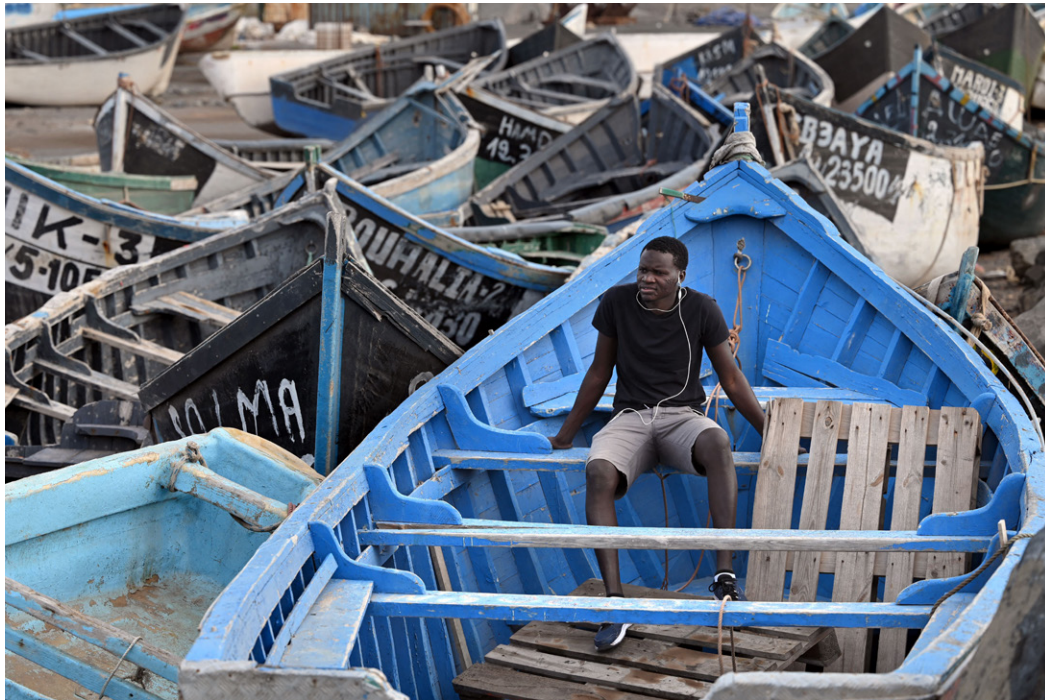
A Malian migrant, who arrived in a boat in August 2020, is pictured in a 'boat cemetery' in Arinaga on 18 November 2021, on the Spanish Canary island of Gran Canaria.

coastguard allows boats to go through, reportedly in exchange for €1 000–€1 200 per departure. While boats leaving from areas just north of Nouakchott may depart without complicity from Mauritanian security services, contacts in Mauritania indicated that boats cannot depart from Nouadhibou without making such arrangements. Boats are generally captained by Senegalese nationals living and working in Mauritania, often as fisherman or in the fishing industry, who navigate small boats out to sea from where migrants can be transferred onto larger vessels that continue to the Canary Islands.