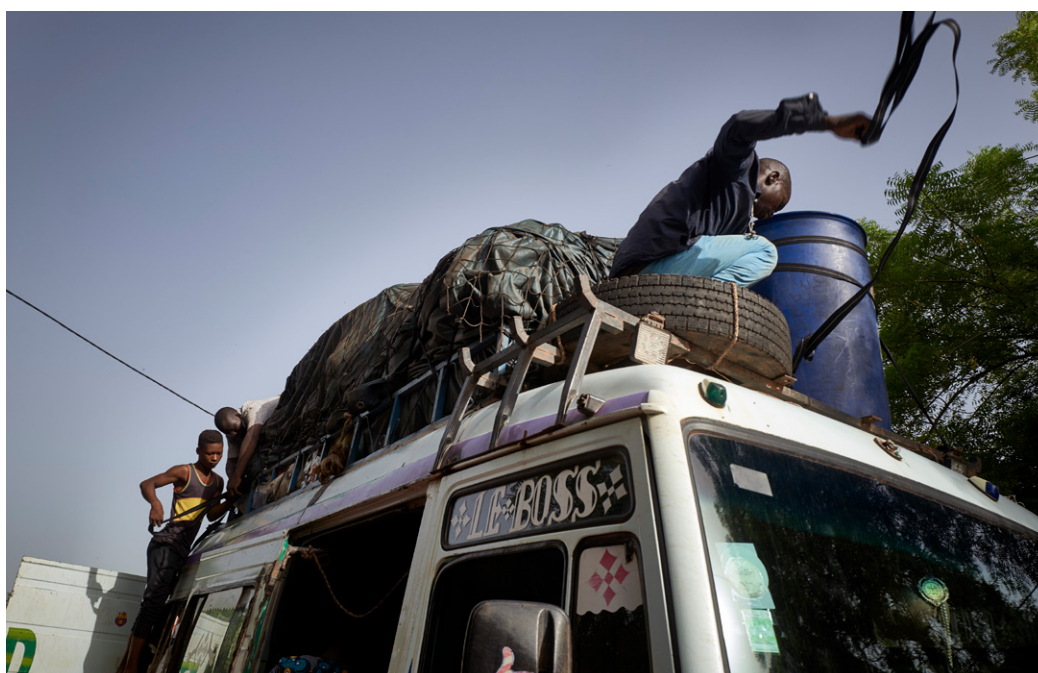
Drivers pack passengers' luggage on a bus before starting the journey from Bamako to Kakolo Mountain in the region of Kayes, 9 July 2020.

Various contacts in northern Mali indicated that the wide availability of subsidized Algerian fuel on the black market in northern Mali, which had briefly been in short supply due to border closures, in part explains a reduction in prices over the course of the year. Other factors include the reduced risk for smugglers now that difficulty in crossing the Algerian border has ebbed, as Algerian authorities have slowly relaxed stringent security and monitoring implemented during the initial phase of the pandemic. Finally, dropping prices reflect an improvement in security in northern Mali, after various armed groups, including signatory groups and jihadists, made arrangements to reduce banditry and conflict along key routes linking Timbuktu to Algeria. This has allowed smugglers to operate with a greater degree of predictability.