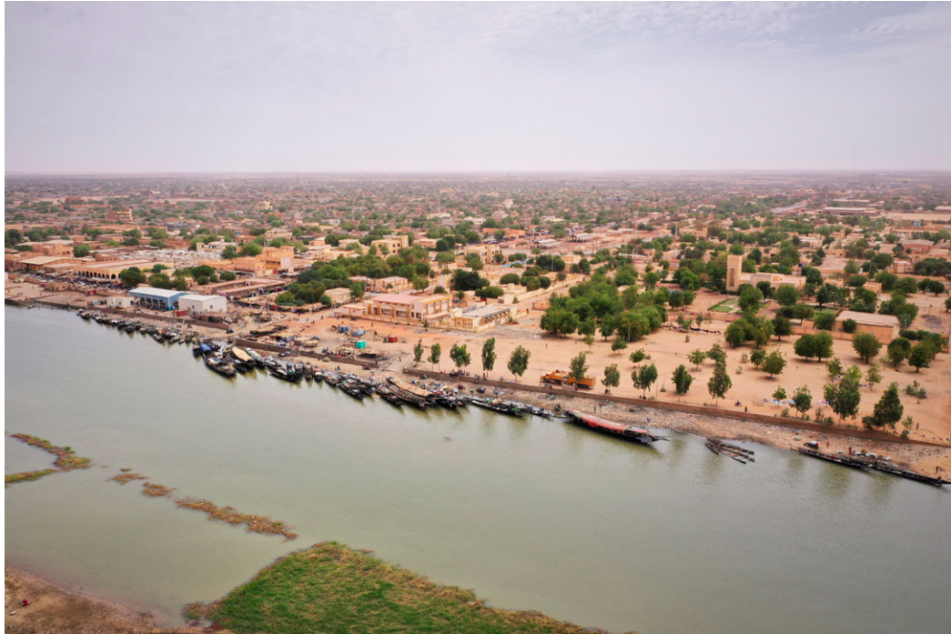
An aerial view taken on 10 March 2020 shows the river Niger near the town of Gao in northern Mali.